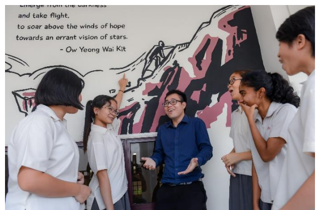
Our poetry mural shows that poetry is for everyone: poetry can inspire students to develop lifelong habits and dispositions

Ultimately, instilling the joy of learning is critical for students to be prepared for the future. Of course, some might claim that joyful learning experiences are secondary to what really matters—results. My response would be this: when students are led to enjoy the process of learning, the results will take care of themselves. Students can become genuinely self-directed learners, gaining the drive and self-confidence they need to succeed in life. Perhaps the mahjong players in Crazy Rich Asians would approve.