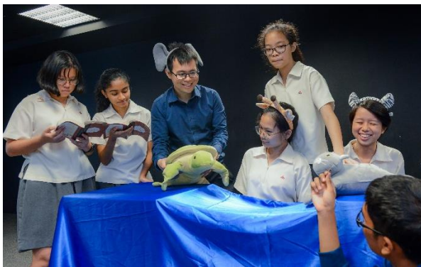
Students dress up and play characters in their Literature texts

Other efforts that my students and I initiated included a poetry mural on our school campus, which was painted by our own alumni, students, and staff. We also edited a magazine, featuring all of our school’s arts events, which we shared with schools in China and other countries. These initiatives—fuelled by our enthusiasm, fervour and zest for learning—have sparked joy amongst the students.